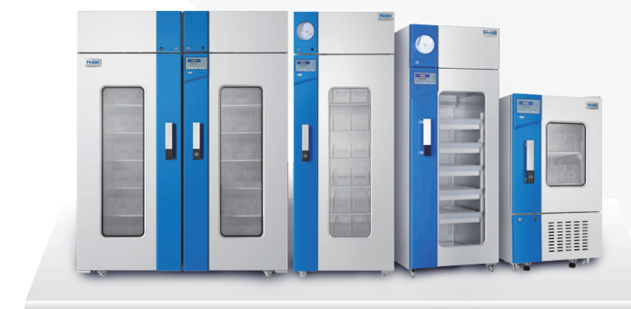
HXC-1369 HXC-629 HXC-429 HXC-149

Refrigeration system is designed with an inverter compressor and dual-speed fans, providing an optimal temperature performance of 4 \pm 1^\circ\text{C} inside the cabinet to safeguard stored products.