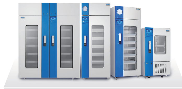
HXC-1369T HXC-629T HXC-429T HXC-149T

Real-time control and monitoring of blood information in the cabinet is possible via built-in smart blood management APP and cloud network connection. Blood product information and temperature are available in large LCD display.